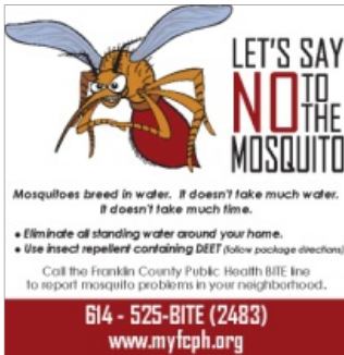
Magnet - Let's Say No to the Mosquito